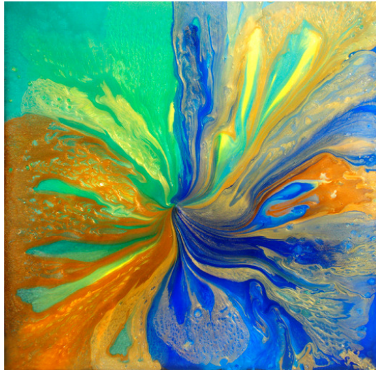
Sepiphyte resin on canvas, 30" x 30"