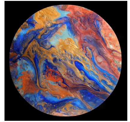
Lava Flow resin on canvas, 23" dia.