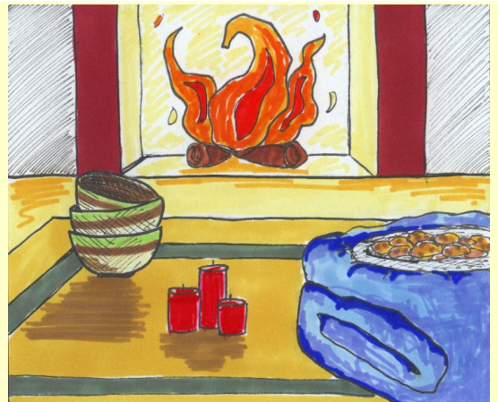
Art by Aimee Williams

Location: Squalicum Boathouse at Zuanich Point Park